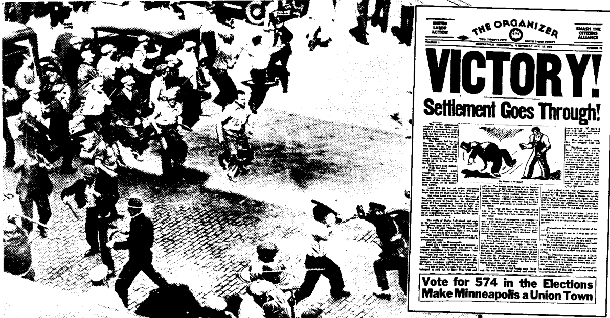
Class war on the streets of Minneapolis as Trotskyists lead 1934 general strike which helped forge Teamsters as powerful national industrial union. Daily strike bulletin, The Organizer , hailed workers' victory.