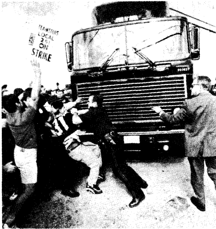
UPS picket line in Rhode Island attacked by cops. These armed thugs of the racist capitalist rulers have no place in the unions!

"All modern strikes require political direction. The strikes of that period brought the government, its agencies and its institutions into the very center of every situation. A strike leader without some conception of a political line was very much out of date already by 1934. The old fashioned trade union movement, which used to deal with the bosses without government interference, belongs in the museum. The modern labor movement must be politically directed because it is confronted by the government at every turn. Our people were prepared for that since they were political people, inspired by political conceptions. The policy of the class