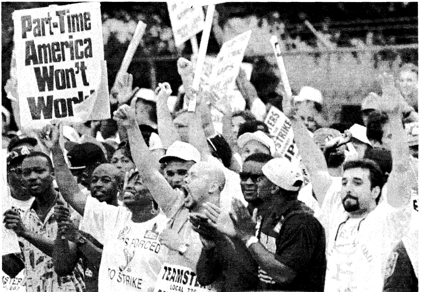
UPS Teamsters joined by other trade unionists at Georgia strike rally, August 14. UPS strike evoked broad sympathy among working people and the poor across the country.

For a Workers Party that Fights for All the Oppressed!